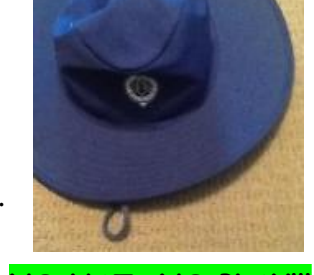
NO HAT, NO PLAY!!!

Our Manly State School uniform is to be worn proudly. The formal day uniform is to be worn every day except for the days when the class has a PE lesson. The formal uniform requires all black shoes. Check the Manly State School website to ensure students are wearing the correct uniform. In our climate, a sun-safe, broad-brimmed hat is essential when playing outside. Every student must bring a hat to school.